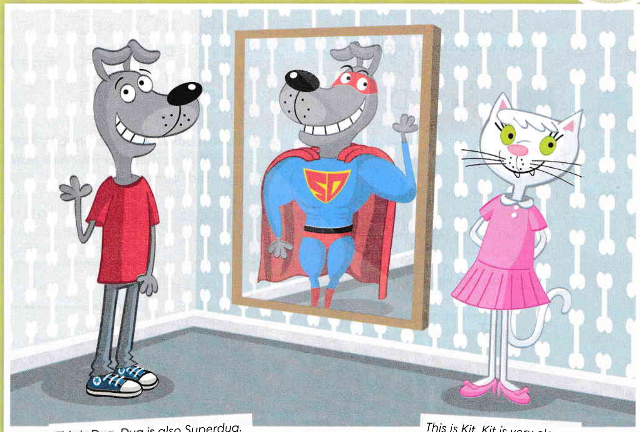
This is Dug. Dug is also Superdug. Superdug is a superhero.