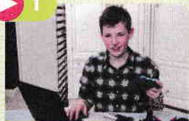
0.1 Intro video